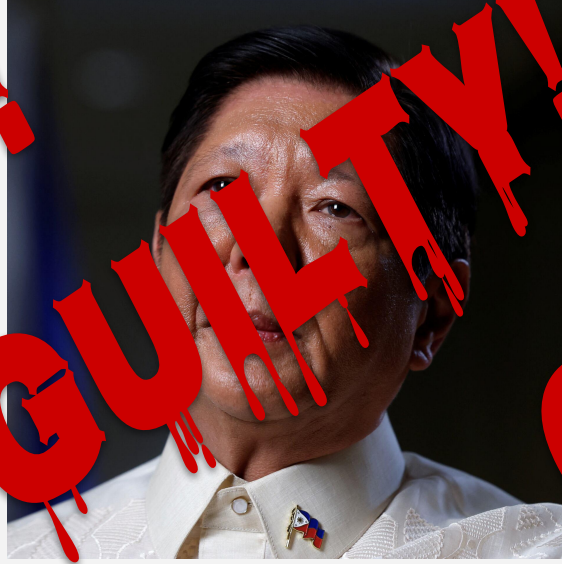
Ferdinand Marcos Jr.