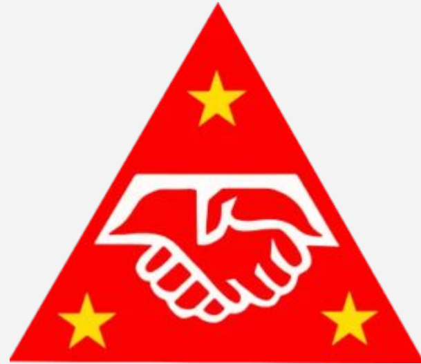
Friends Of The Filipino People In Struggle