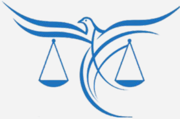
International Association Of Democratic Lawyers